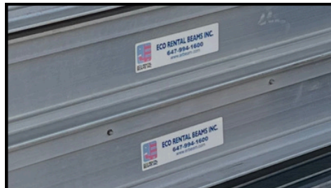
ECO 6-1/2" Aluminium Beam