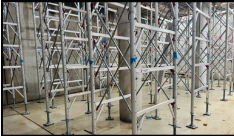
ECO 12K Aluminum Shoring Frame