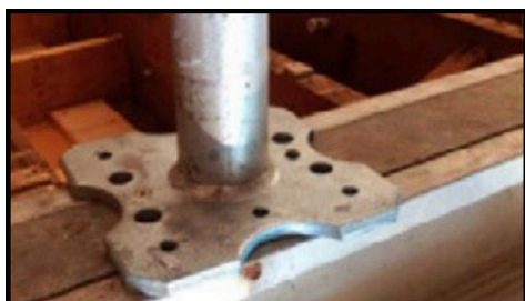
ECO Hot Dip Galvanized Steel Post Shores