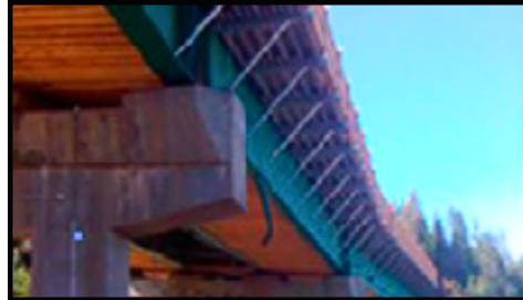
ECO 12K Aluminum Bridge Overhang Bracket