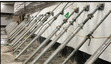
ECO 25K Aluminum Push-Pull Brace